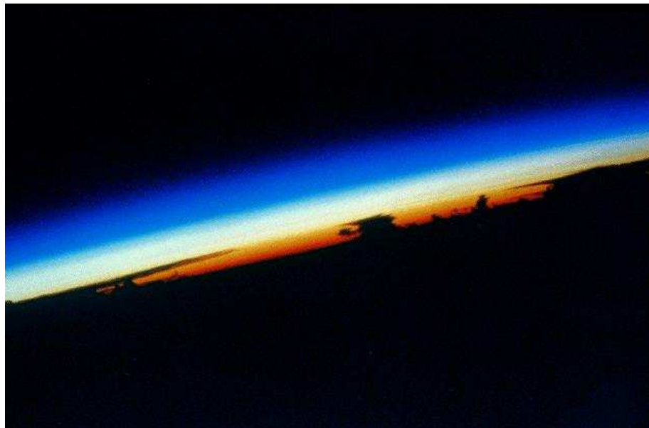
The blue orgone (life energy) envelope of our planet (seen from the surface of the earth as "sky")

We, i.e. the team of Desert Greening, not only apply the technology to generate natural rain, but also make use of various tried and tested methods of life-energetic activation of water, soil and plants. This interaction creates a basis for an extensive recovery of nature – even in areas where the natural habitat has largely collapsed, i.e. in deserts.